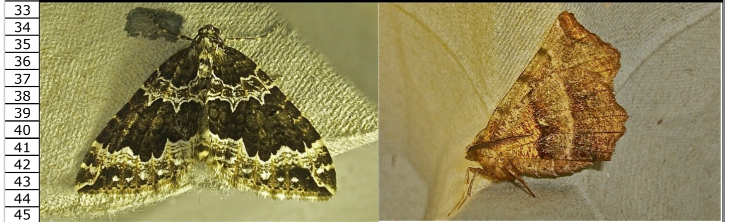
1750 Water Carpet ( Lampropteryx suffumata ) 1917 Early Thorn ( Selenia dentaria )