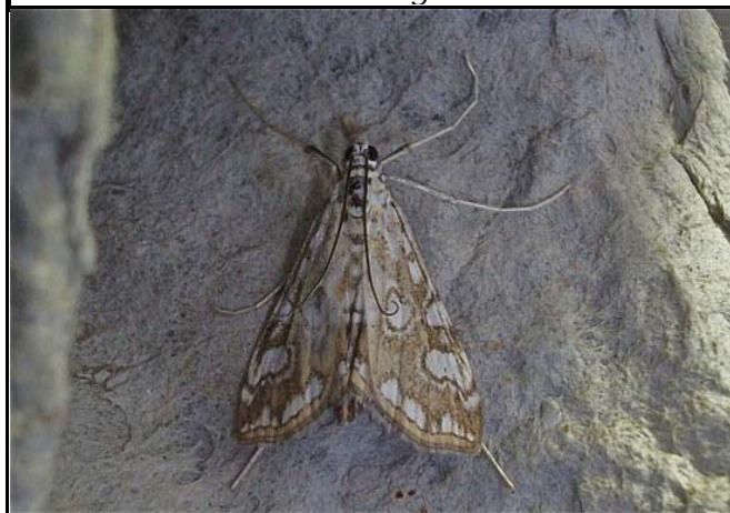
1345 Brown China-mark ( Elophila nymphaeata )