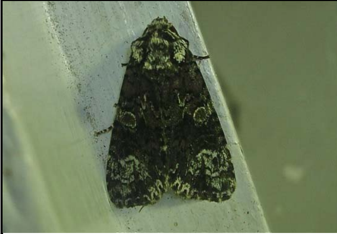
2291 Coronet ( Craniophora ligustri )