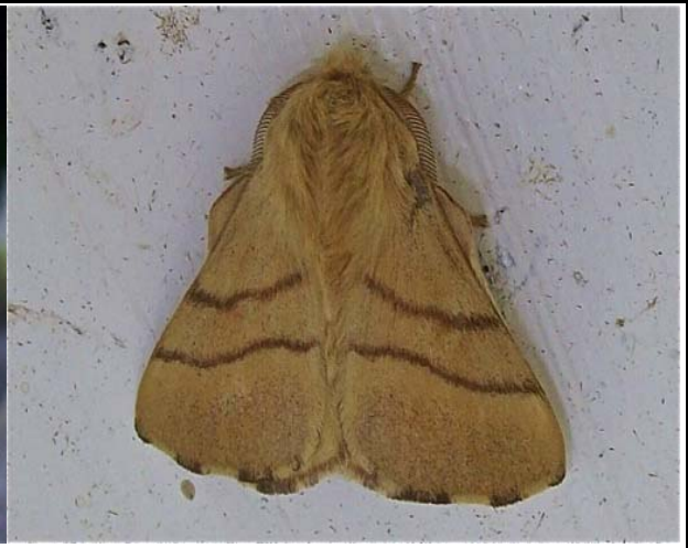
1634 Lackey ( Malacosoma neustria )