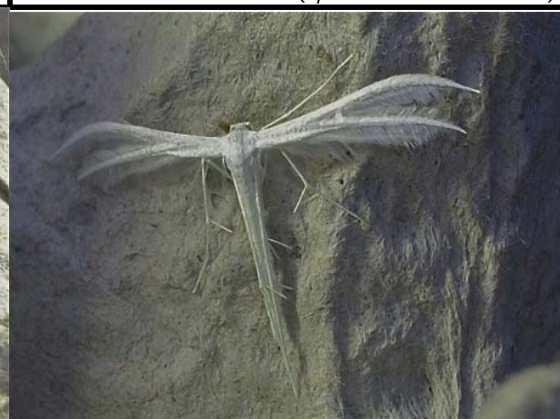
1513 Large White Plume ( Pterophorus pentadactyla )