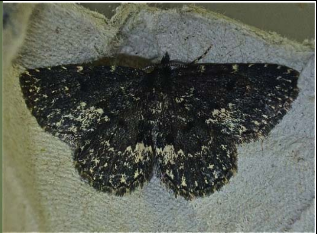
2475 Waved Black ( Parascotia fuliginaria )