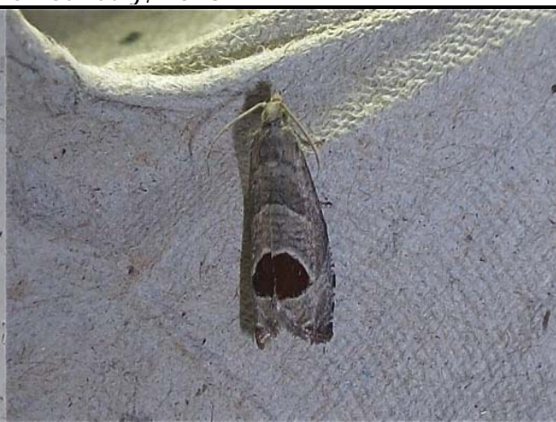
1175 Bramble Shoot Moth ( Epiblema uddmanniana )