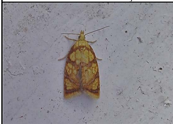
1035 Acleris bergmanniana