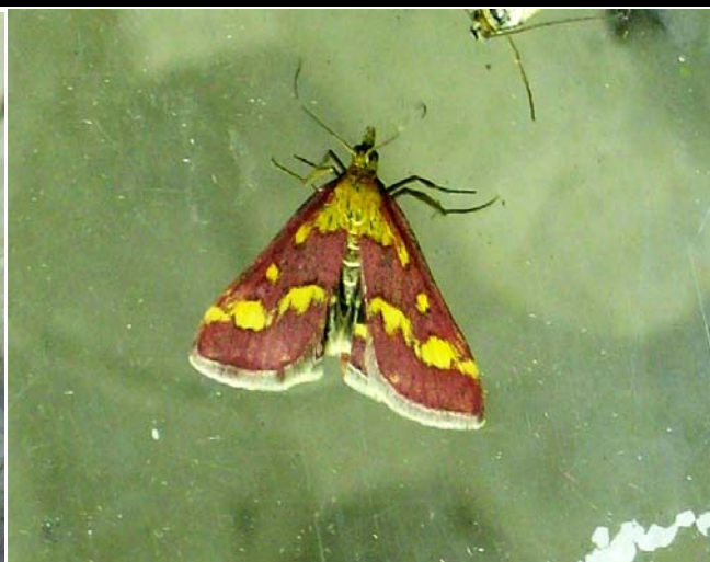
1362 Pyrausta purpuralis