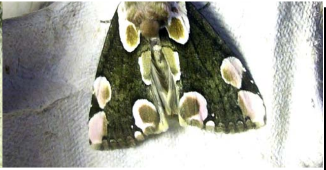
1652 Peach Blossom ( Thyatira batis )