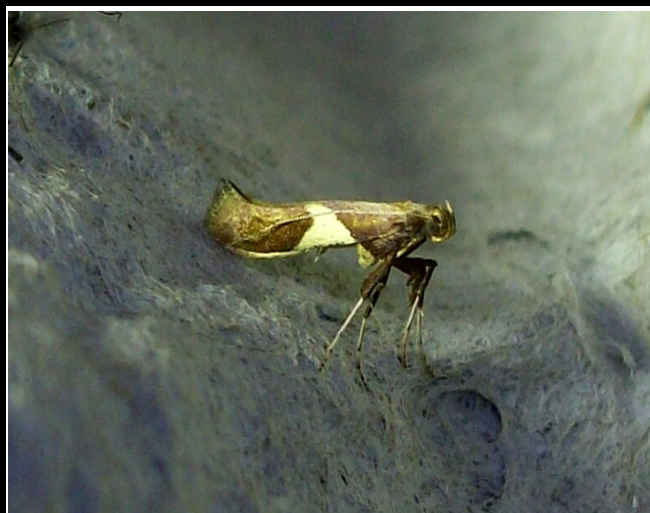
288 Caloptilia stigmatella