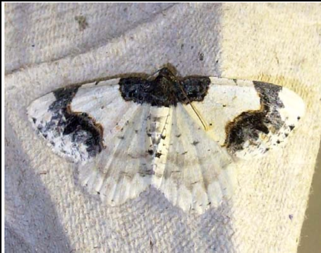
1888 Scorched Carpet ( Ligdia adustata )