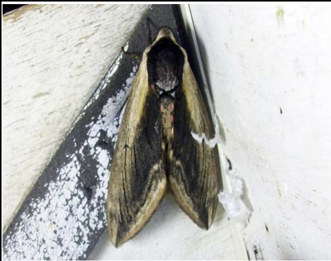
1976 Privet Hawk-moth ( Sphinx ligustri )