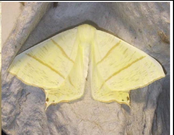
1922 Swallow-tailed Moth ( Ourapteryx sambucaria )