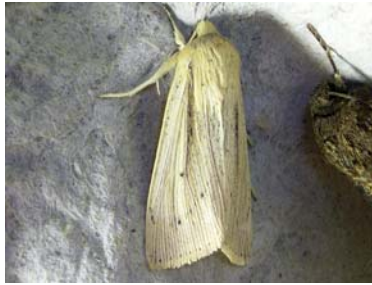
2197 Southern Wainscot ( Mythimna straminea )