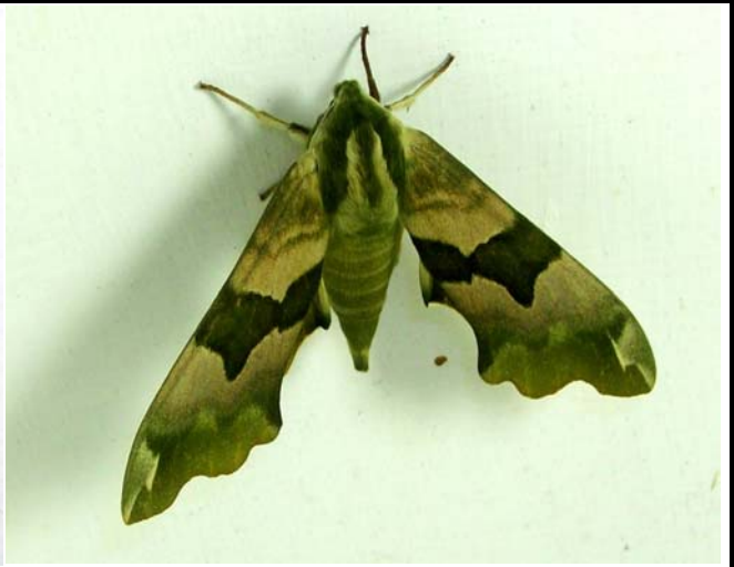
1979 Lime Hawk-moth ( Mimas tiliae )