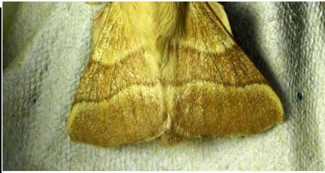
1634 Lackey ( Malacosoma neustria )