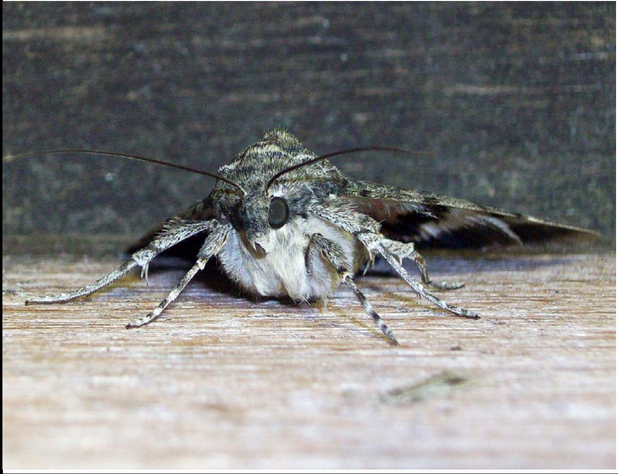
2452 Red Underwing ( Catocala nupta )