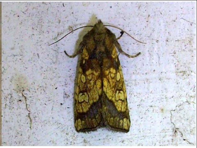
2267 Beaded Chestnut ( Agrochola lychnidis )