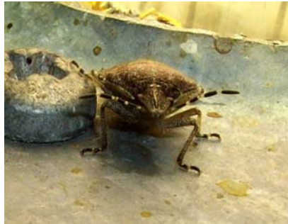
Sloe Shieldbug ( )