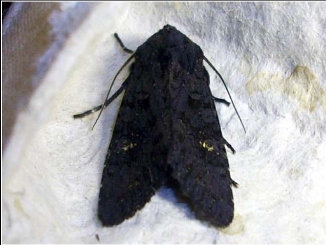
2231 Deep-brown Dart ( Aporophyla lutulenta )