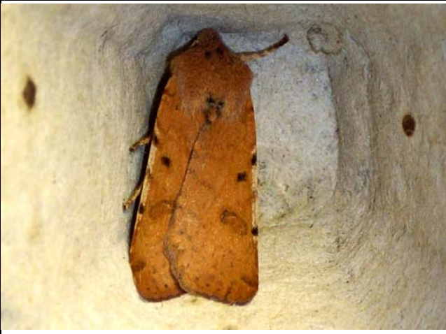
2266 Brown-spot Pinion ( Agrochola litura )