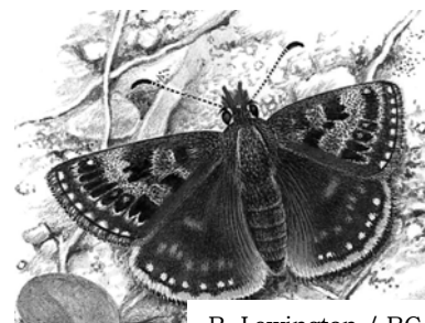
R. Lewington / BC

The dingy skipper butterfly is well-named. It appears from a distance to be drab and unspectacular and is easily mistaken for a day flying moth such as the burnet companion, or more likely, overlooked completely. In dull weather and at night it perches on the top of dead flower heads in a moth-like fashion with wings curved in a position not seen in any other British butterfly. On warm sunny days it can be highly active and territorial.